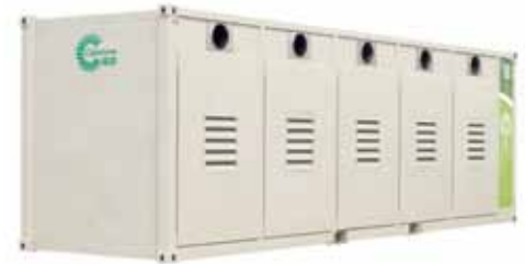
C1000 Power Package